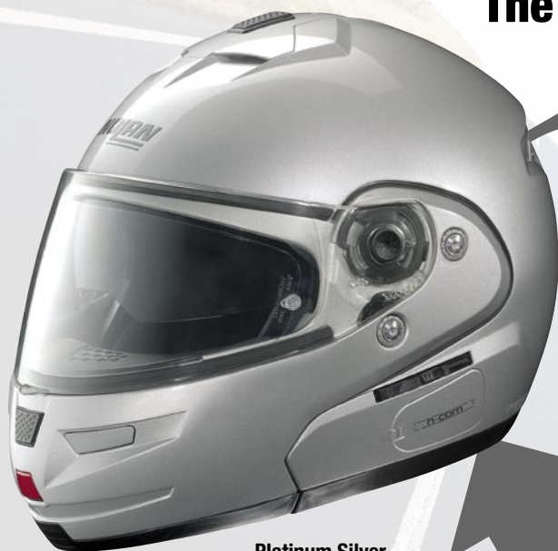
Platinum Silver N5005_