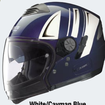
White/Cayman Blue N4118_