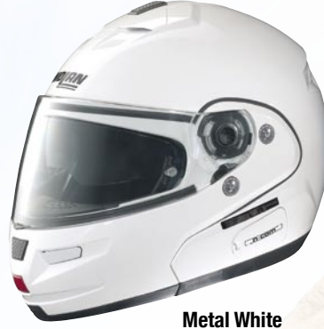
Metal White N5014_