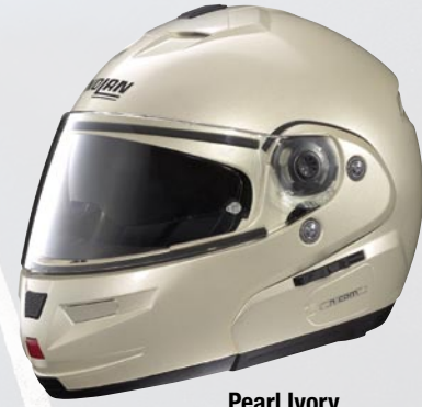
Pearl Ivory N5017_