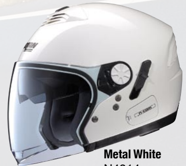
Metal White N4314_