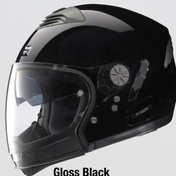
Gloss Black N4025_

The N43 Trilogy Outlaw offers the same features as the N43 Trilogy, with no visible Nolan logo front or back, and a removable Outlaw emblem on the forehead.