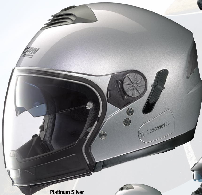
Platinum Silver N4005