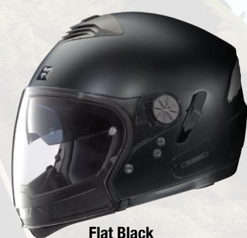
Flat Black N4026_