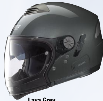
Lava Grey N4006_