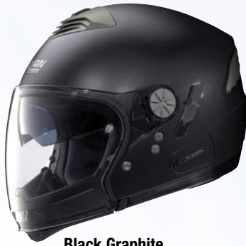
Black Graphite N4010_