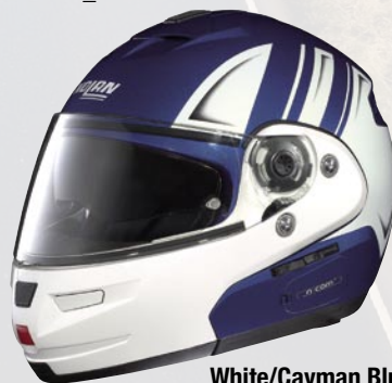
White/Cayman Blue N5118_