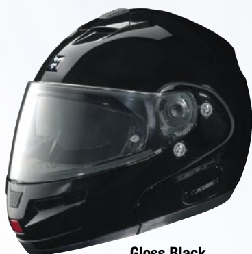
Gloss Black N5025_

The N103 Outlaw offers the same features as the N103, with no visible Nolan logo front or back, and a removable Outlaw emblem on the forehead.