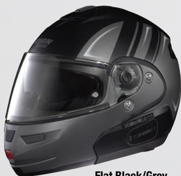
Flat Black/Grey N5120_