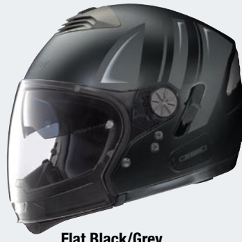
Flat Black/Grey N4120_