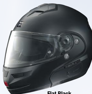
Flat Black N5026_