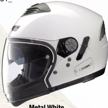
Metal White N4014_