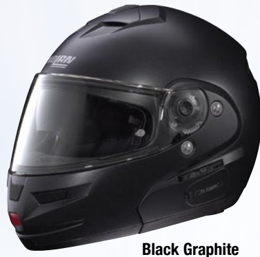
Black Graphite N5010_