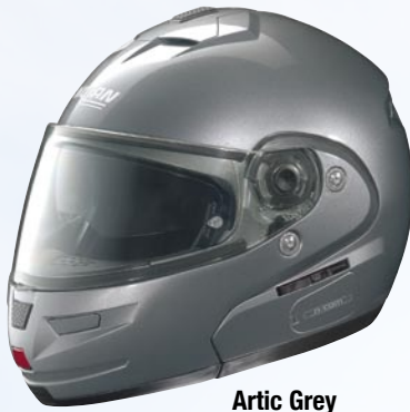
Artic Grey N5007_