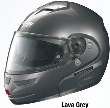
Lava Grey N5006_