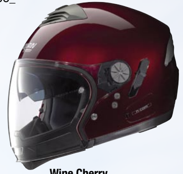
Wine Cherry N4008_