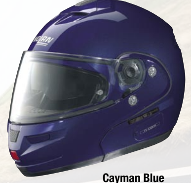
Cayman Blue N5003_