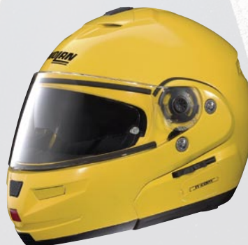
Cab Yellow N5004_