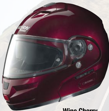
Wine Cherry N5008_